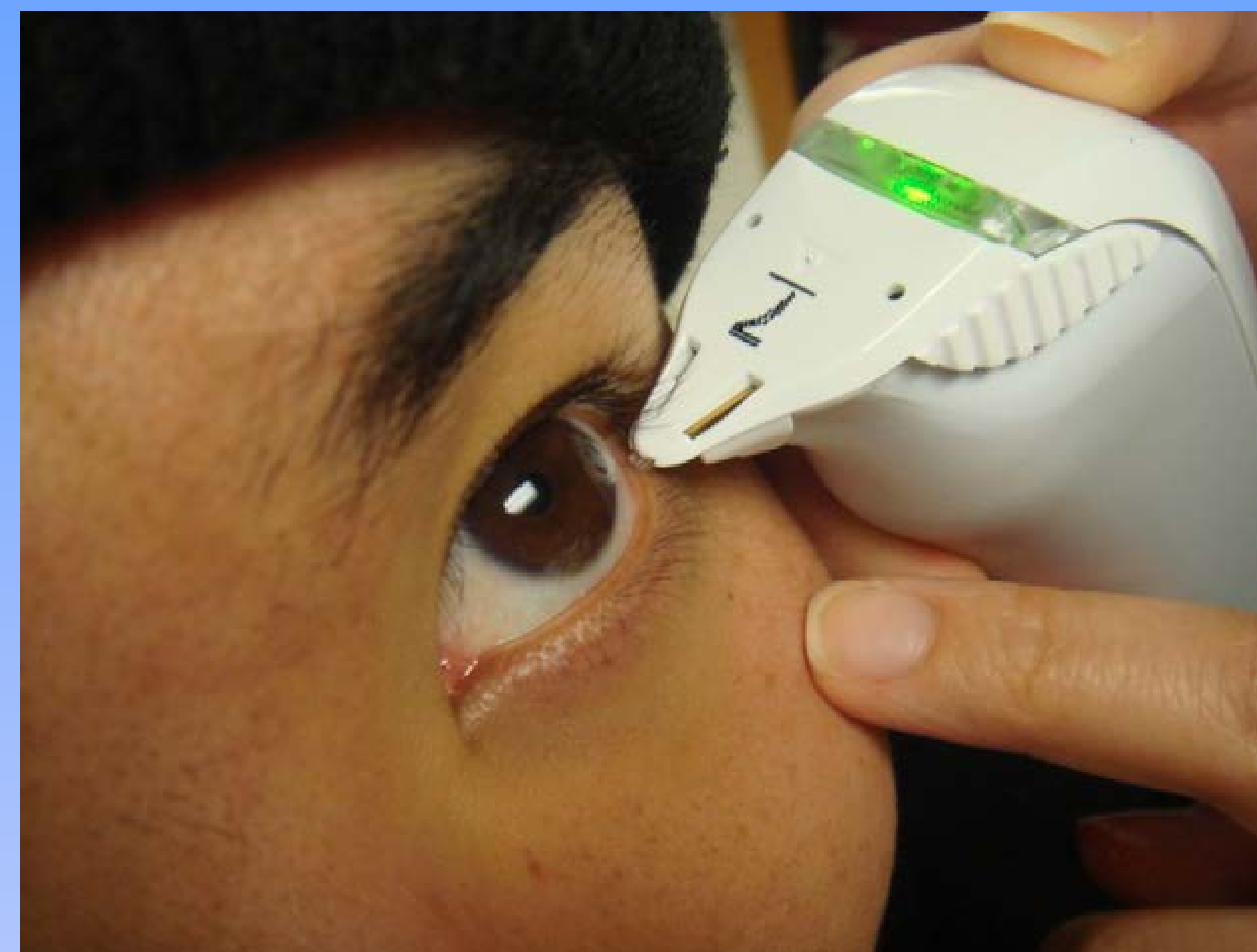
FIGURE 1. TearLab collecting a 50-ul tear sample.

After overnight fasting from food and drink, subjects had baseline tear osmolarity measured for both eyes. They then drank 30 oz of water in 30 minutes. TearLab measurements were repeated at 30 minutes, 2 and 3 hours post baseline. A modified SANDE questionnaire assessing symptoms was given before and after treatment.